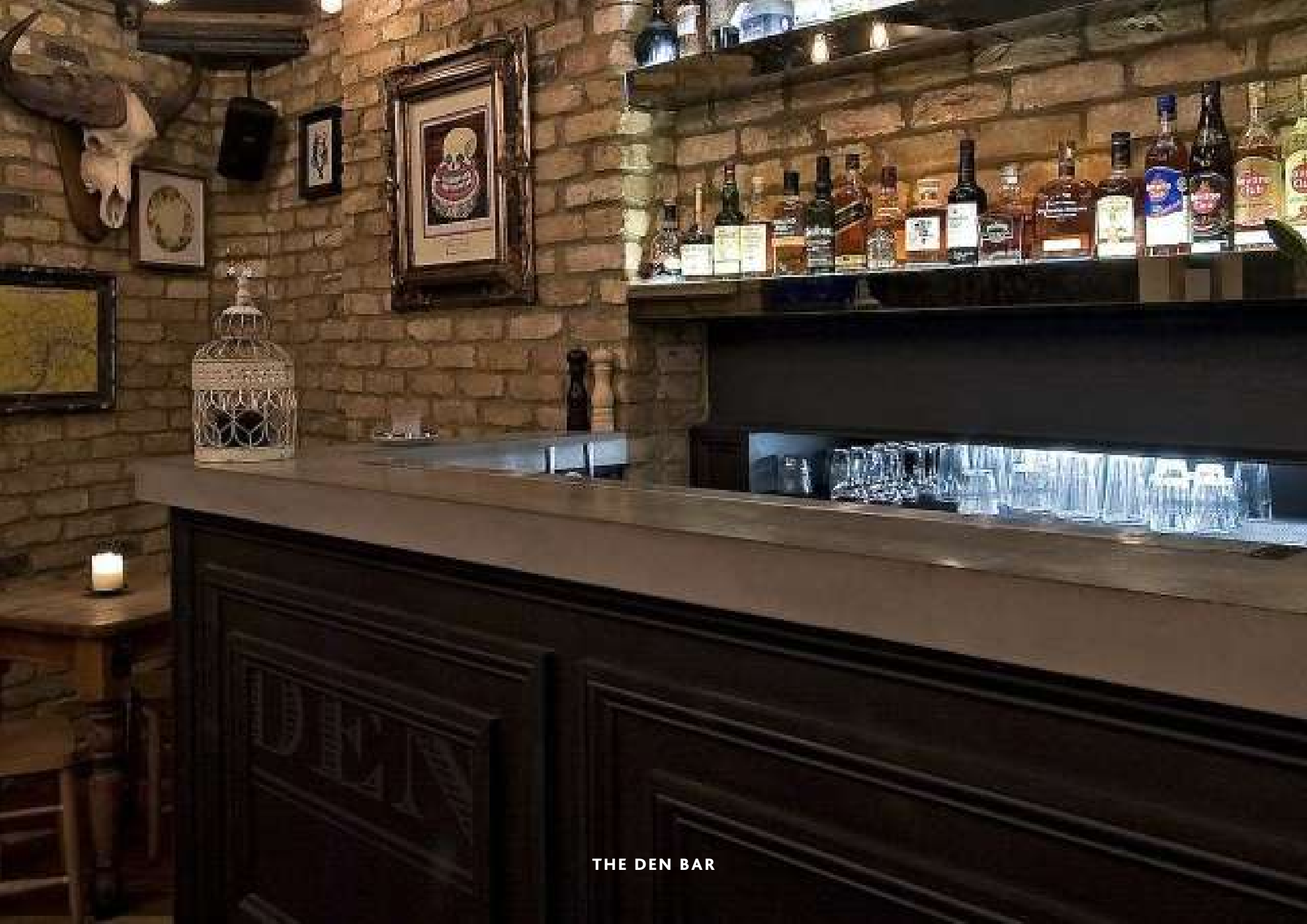
THE DEN BAR